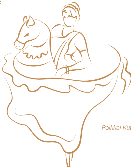
Poikkal Kuthirai Aattam